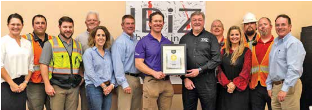
Above: The RoyOMartin-Plywood team in Chopin, La., received the first place for the 2021 Annual Safety and Health Award and the 2021 3-Year Safety Award.