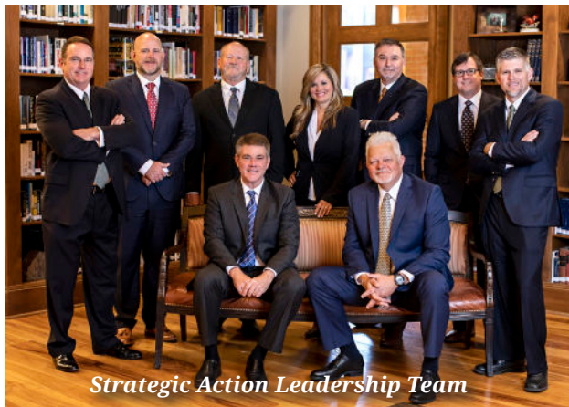
Strategic Action Leadership Team