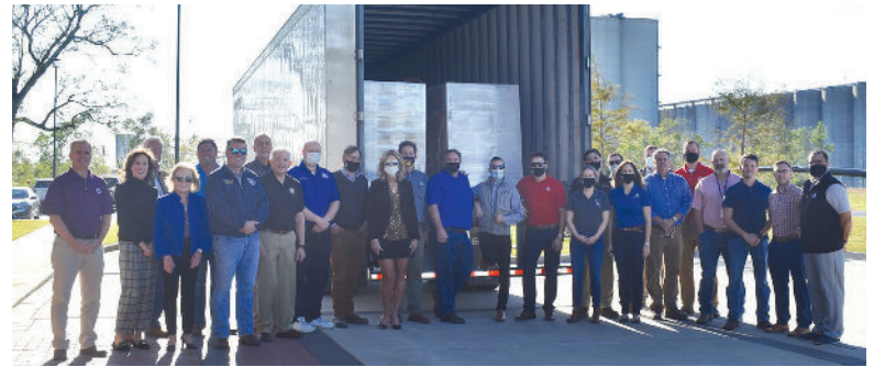
Individuals representing Morning Star, Union Pacific Railroad, and various other organizations received food donations in Lake Charles. The food (right) was transported to the Food Bank of Central Louisiana in Alexandria.

By November 3, fifteen pallets of the tomato products had made their way by truck to Alexandria, La., where they