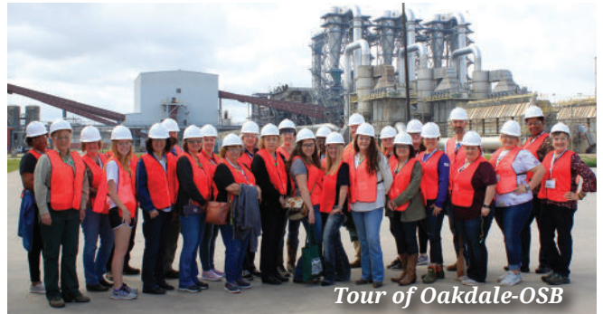
Tour of Oakdale-OSB