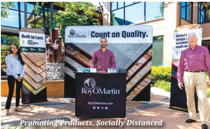
Promoting Products, Socially Distanced