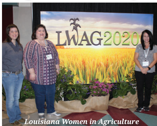
Louisiana Women in Agriculture