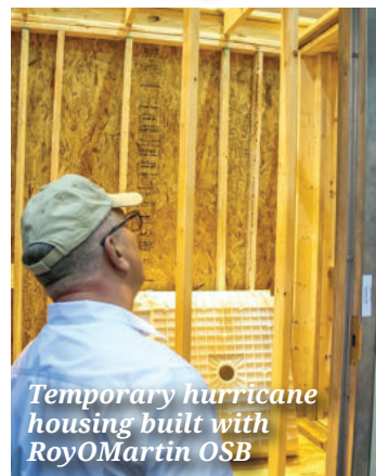
Temporary hurricane housing built with RoyOMartin OSB