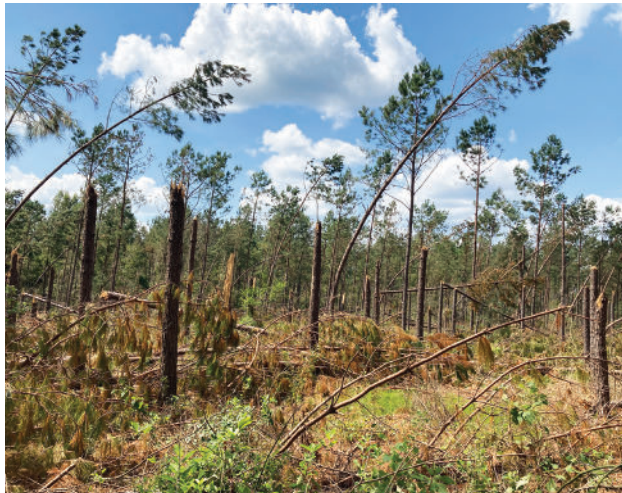
Wind speeds from Hurricane Laura reached up to 149 mph, causing many young trees to be uprooted or affected in their growth.