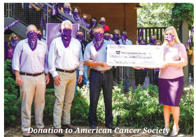
Donation to American Cancer Society