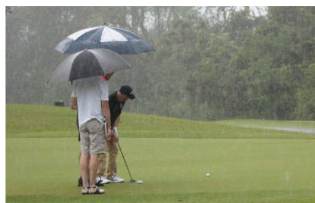
For the only time in event history, rain was so heavy that it caused the golf tournament cancellation.