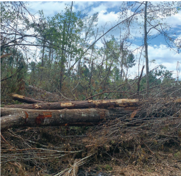
(Above) Hurricane Laura caused significant damage in some of Louisiana's forests. (Below) Fallen trees and debris in the waterways can be seen in this aerial photo.