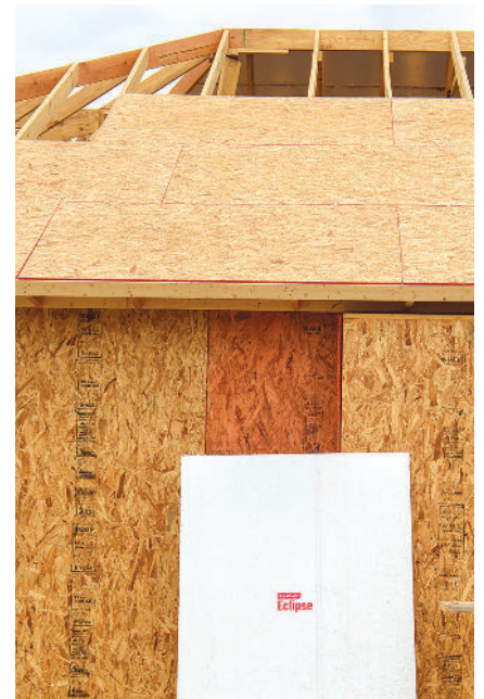
Eclipse™ OSB Radiant Barrier is covered with foil on one side, commonly used foil-side down in roofing.