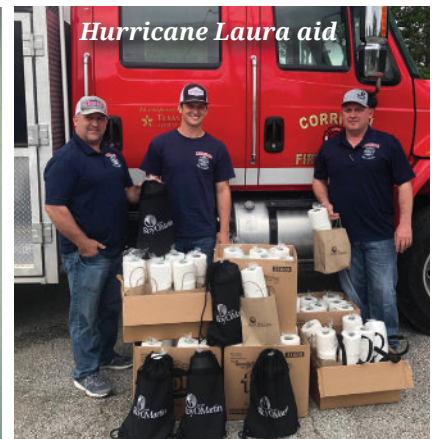
Hurricane Laura aid