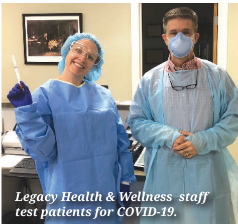
Legacy Health & Wellness staff test patients for COVID-19.