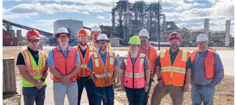
(Photo above) RoyOMartin University class tours the Oakdale OSB manufacturing facility.