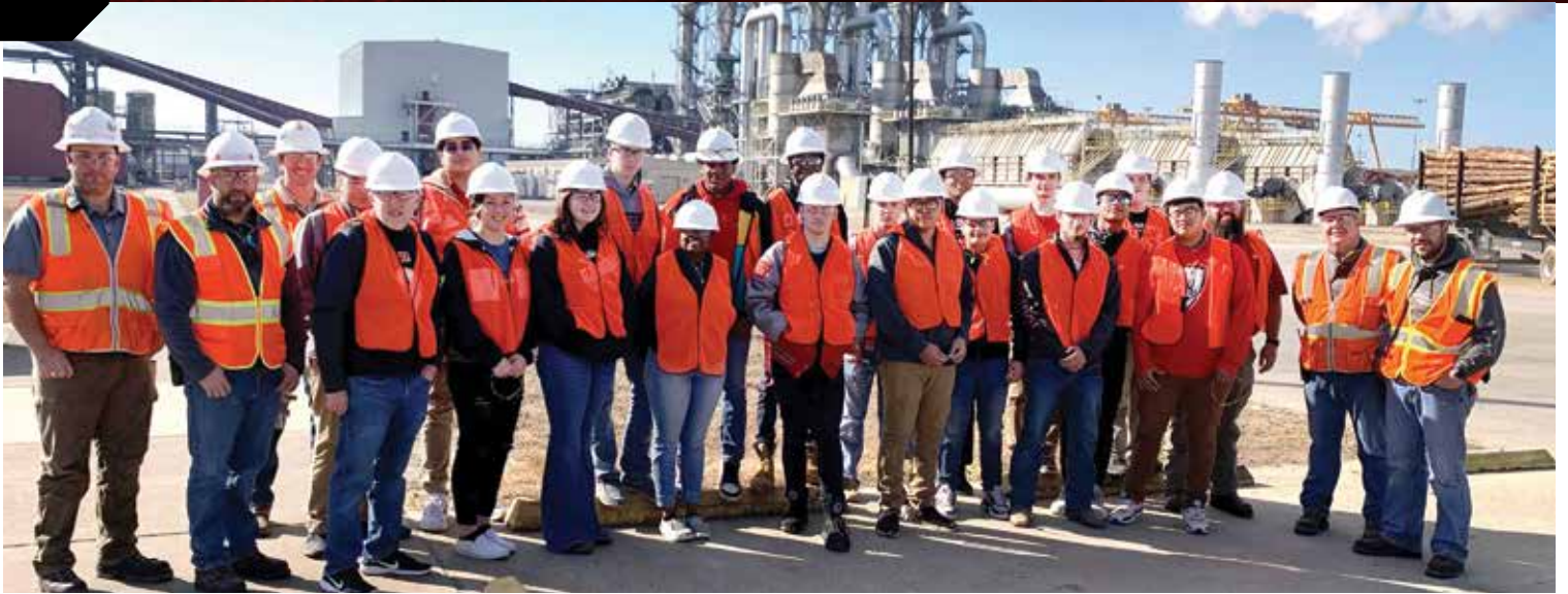
Glenmora High School WoodWorks students tour the Oakdale-OSB manufacturing facility.