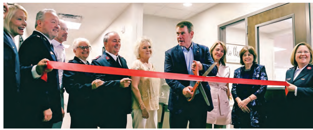
Members of the Martin Family and representaives of the Salvation Army commemorate the opening of the Center of Hope.