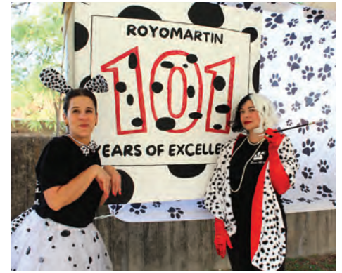
RoyOMartin team members participated in the Relay for Life event held in April.

The Relay for Life campaign is one more way we give back to the communities where we live and work ... with compassion, courage, and the power of one united team.