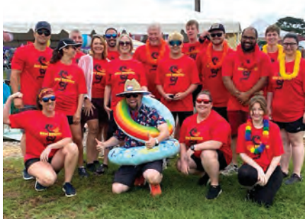
Louisiana Dragon Boat Races, supporting the Alexandria Museum of Art