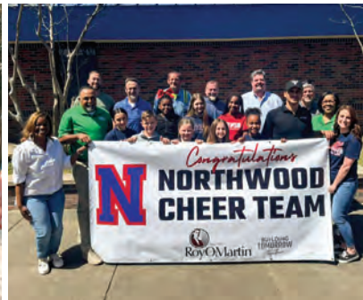
Northwood High School National Cheerleading Championship