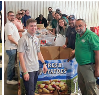
Food Bank of Central Louisiana