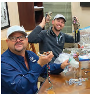
Family Crisis Center of East Texas