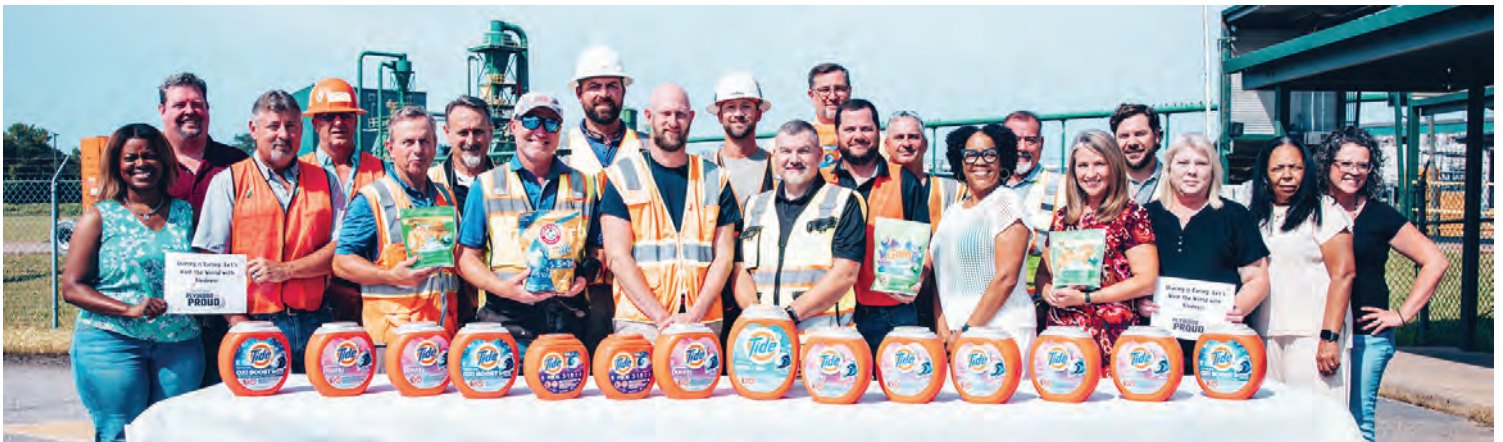
Detergent donations to Hope House and the Central Louisiana Homeless Coalition