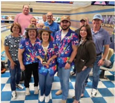
Bowling for Buddies, supporting the YWCA