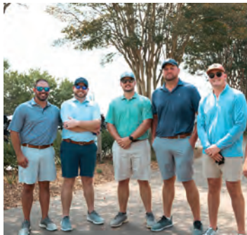
LSTA Golf Classic, supporting the Louisiana Baptist Children's Home