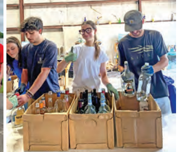
Glass Act Recycling