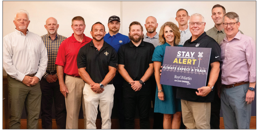
Union Pacific participated in RoyOMartin's Safety Day, helping reinforce public safety with this valued customer's team.

The partnership extended beyond planning. At Union Pacific's suggestion,