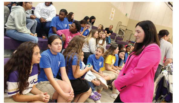
RoyOMartin team members mentor student participants at Oakdale Middle School in Oakdale, La.