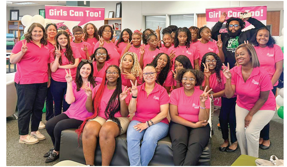
Girls Can Too! participants and mentors at Peabody Magnet High School in Alexandria, La.

We are proud to invest in the next generation and even prouder to watch these young ladies discover that they are capable of more than they ever imagined.